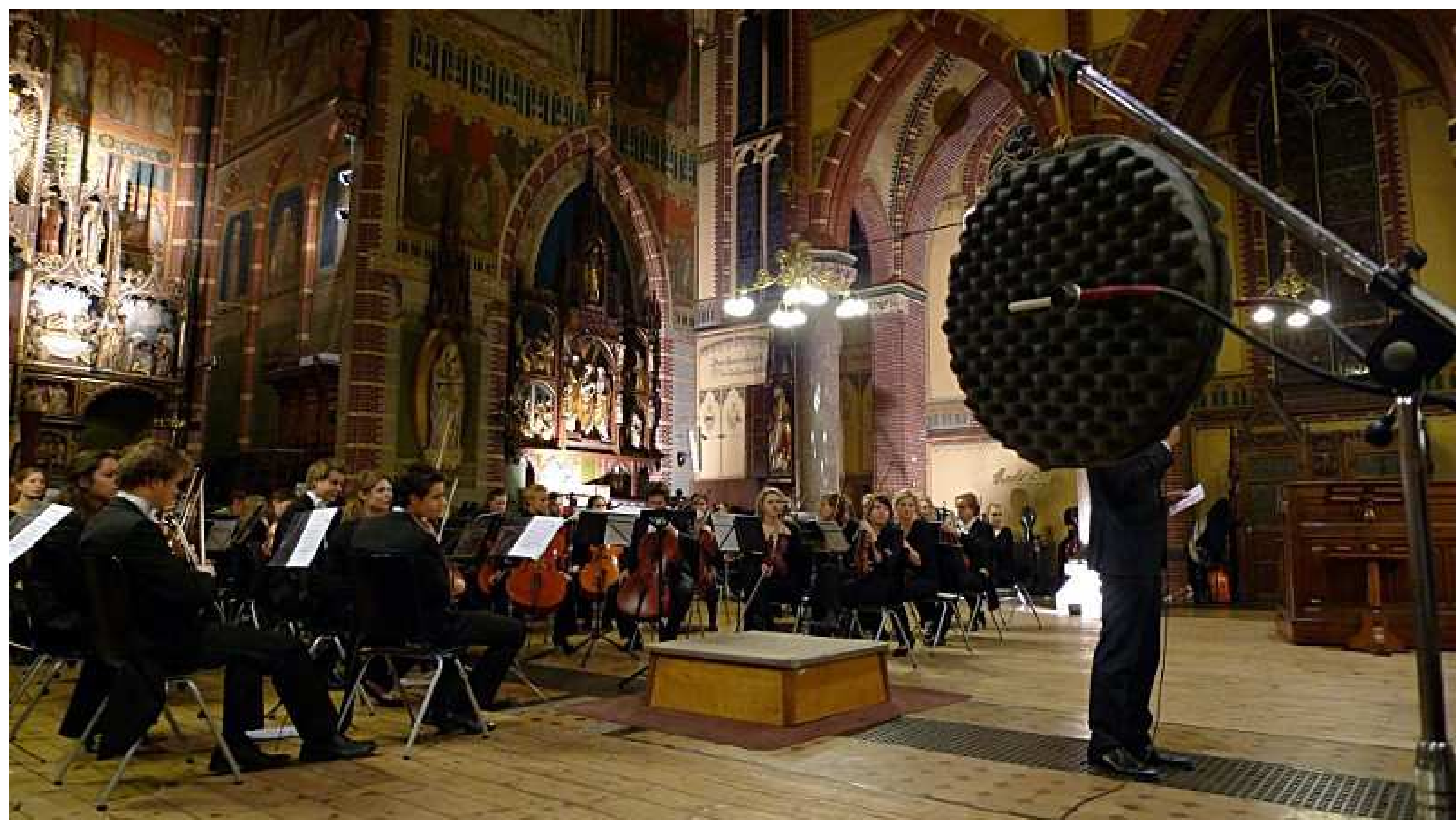
Figure 1. Jecklin Disk

Introduction: The Jecklin Disk is a sound absorbing disk placed between two omnidirectional microphones. It is used to recreate some of the frequency-response, time and amplitude variations human listeners' experience, but in such a way that the recordings also produce a useful stereo image through loudspeakers.